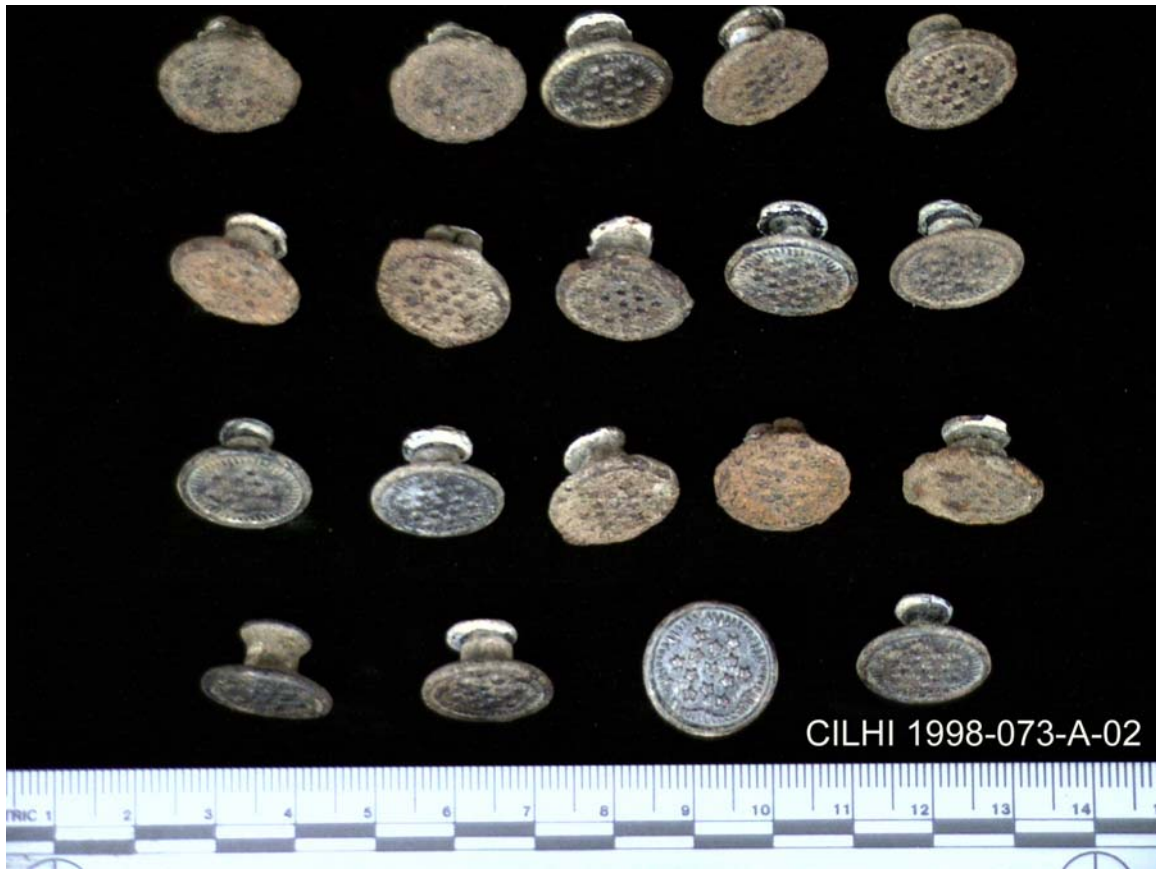
Figure 2. Nineteen “Burst of Glory” thirteen-star metal-tack buttons.