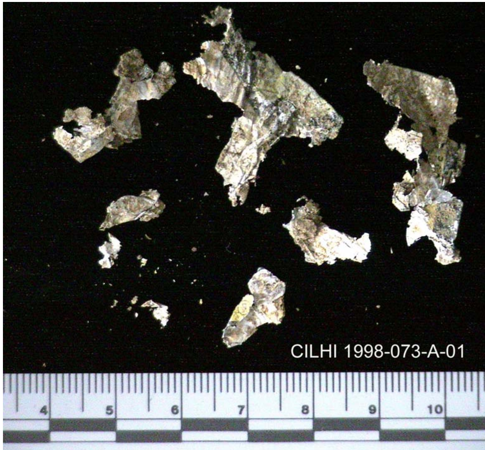
Figure 1. Numerous fragments of silver colored foil.